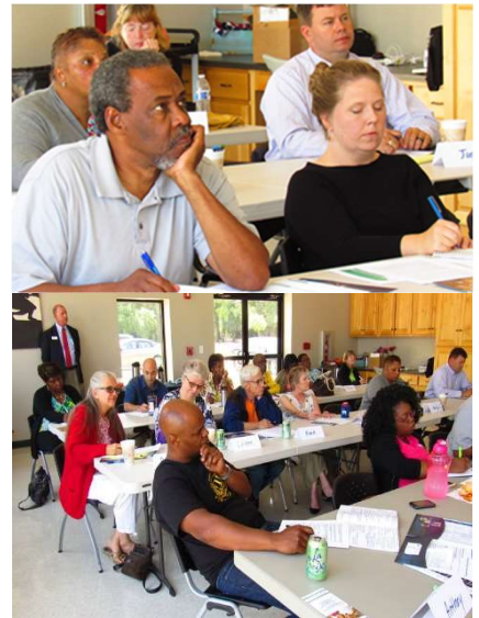
Entrepreneurship Training Workshop Fall 2017