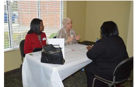
Savannah River Site Representatives