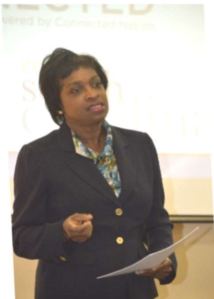
Federal Communications Commissioner Mignon L. Clyburn